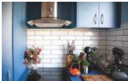
The kitchen, with obsession-inducing cooktop.

Sophia decided early on that she would buy a pre-made kit home and then retrofit it to increase the energy efficiency of the building. Buying a kit home costs far less than a custom designed house: according to the Your Home website, "Volume housing typically costs less per square metre than a custom designed and built house. Floor plans vary but they are designed and built