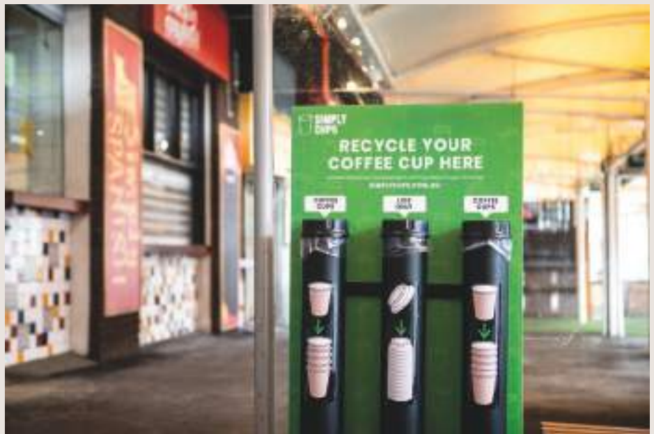
Behold, a minor miracle: a place to recycle your takeaway coffee cup!

The bins are emptied regularly, and the cups are then distributed to local manufacturers to make upcycled products. A few examples: plastic manufacturer Newtecpoly uses whole cups to strengthen its recycled-plastic products like roadside curbing and outdoor seating, while Albury start-up Plastic Forest produces mini wheel stops, air-conditioner mounting blocks and garden beds. Recycled cups are also used in the manufacture of the Stay Tray, a reusable drinks holder invented by Melbourne entrepreneur Kate Stewart, which is made from 100% recycled material, while Simply