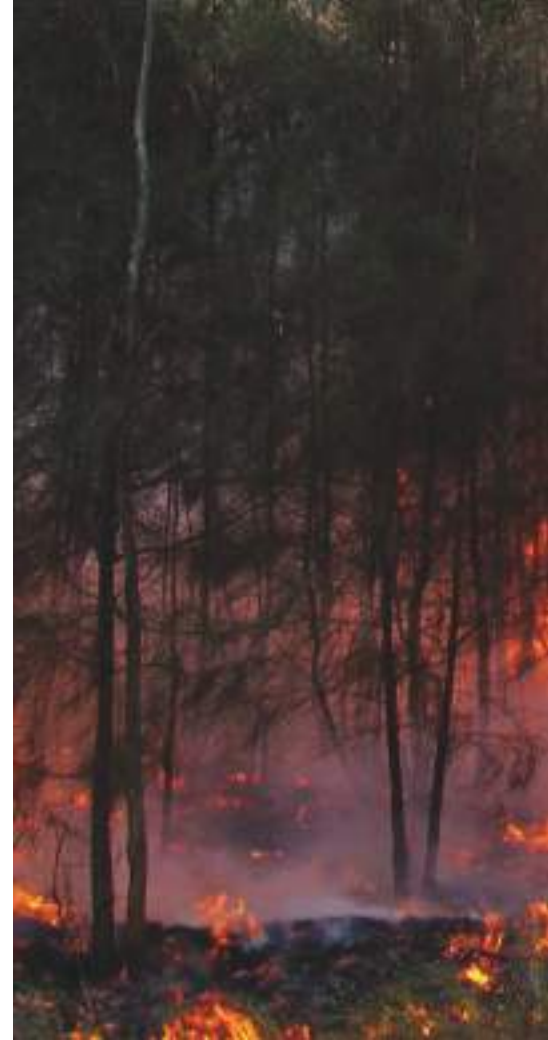
Bushfires: learning the hard way. Again.

In Queensland, meanwhile, the Morrison government has awarded a $3.6m grant to Shine Energy, a relatively small indigenous-