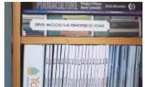
An entirely random selection of magazines.