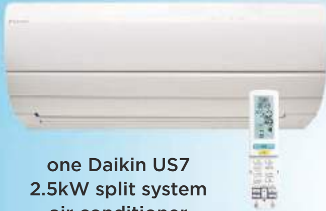
one Daikin US7 2.5kW split system air conditioner

Subscribe to Renew and you could win a Home Energy Super Saver mega-prize from Pure Electric worth $10,000!