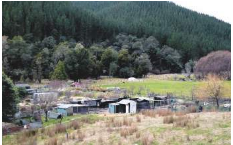
The solar pumping system provides water for the house, the veggie garden and chooks on this off-grid 20 ha property on the South Island of New Zealand.

However, maximisers have another problem: when they retire gracefully after startup, the sun may get strong enough around noon to put the full panel voltage on the pump motor, often exceeding the pump's specs and burning out its brushes. A brushless DC pump would be quite useful in these situations, but the only ones we've seen have been expensive compared to brushed motor units. A maximiser with a voltage limiting capability would work, but that adds more complexity. We've adopted a different approach, driven in part by new technology.