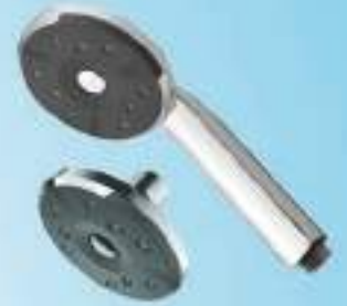
+ two Methven Kiri Satinjet Ultra Low Flow shower heads