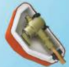
+ one ValveCosy PTR insulator

Subscribe to Renew or join Renew by 5pm AEDT on Friday, 30 October 2020 to go in the draw to win.