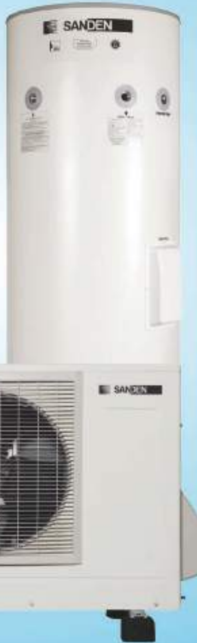
+ one Sanden Eco Plus 300L hot water heat pump system